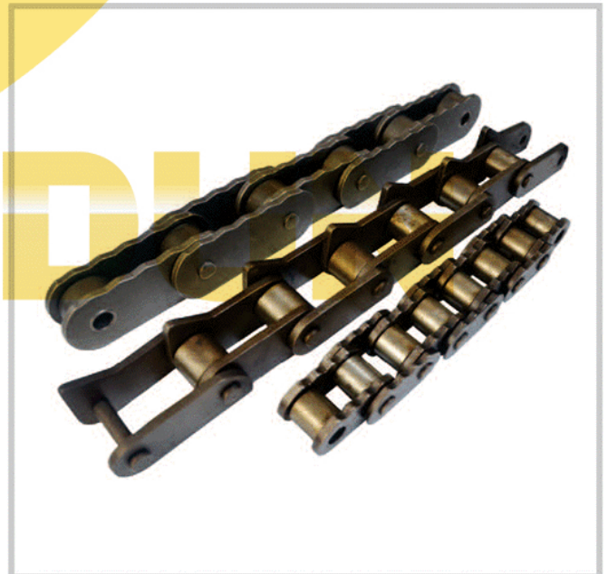
Sawchain for Steel Mill