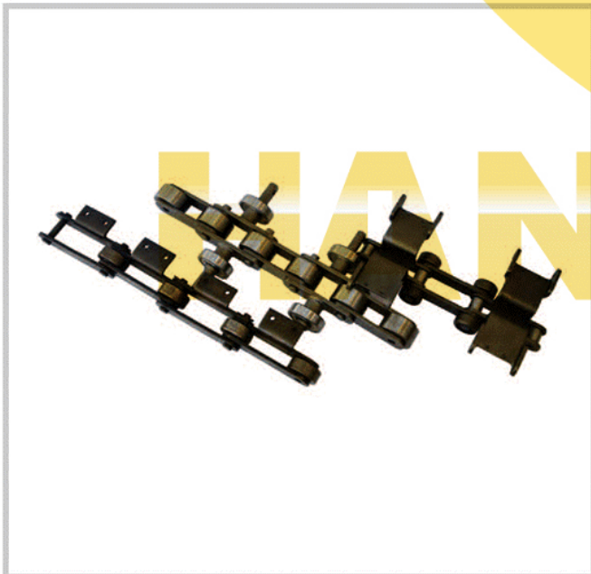
Rubber Glove Industry